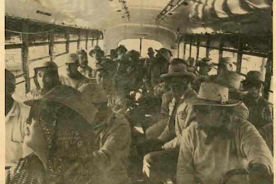
THIS BUSLOAD OF FIELD WORKERS, one of many, refused to get out when driven to the Di Giorgio politing place. The Loycett was successial.

Approximately 30 field workers voted. The rest of the voters were office workers, carpenters, plumbers, shed men, and some of the high-school students hired