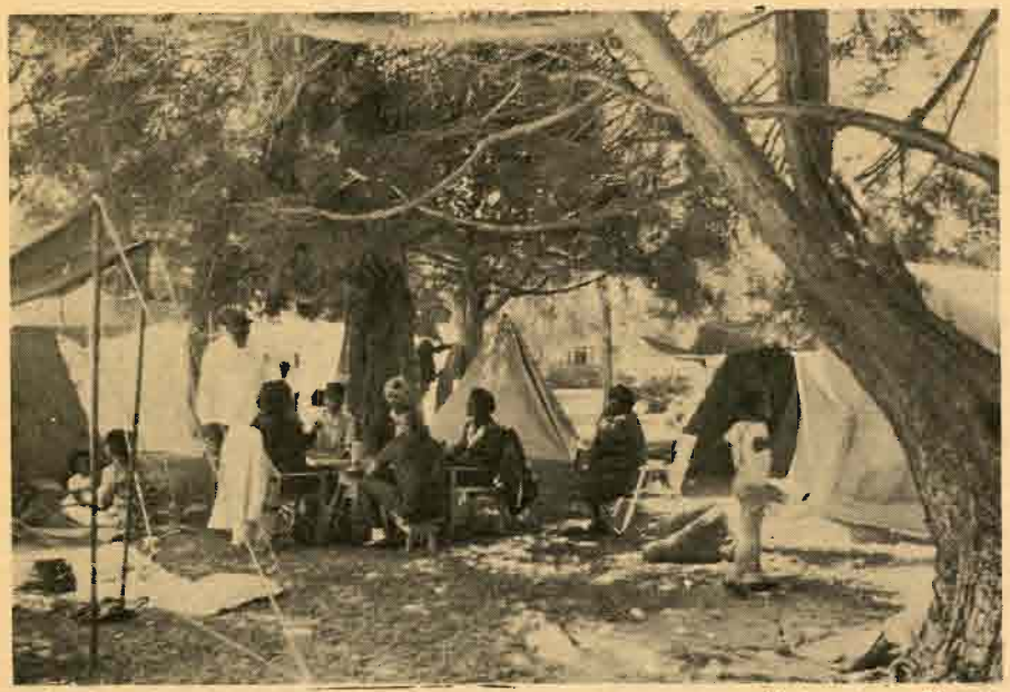
On Saturday, June 18th, about 25 Negro families from the Esturay Public Housing project of Alameda City pitched tents in the city's Franklin Park in the middle